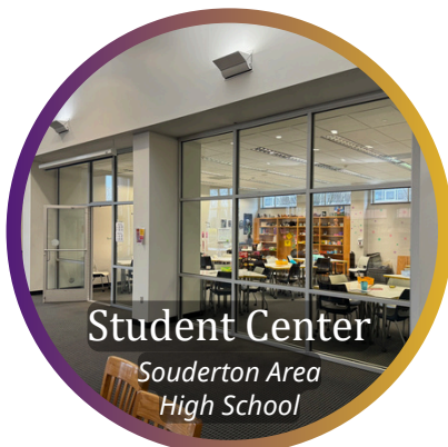
Student Center Souderton Area High School