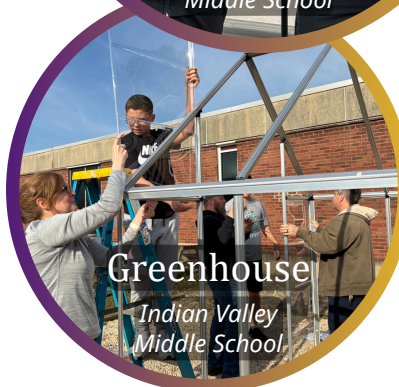
Greenhouse Indian Valley Middle School