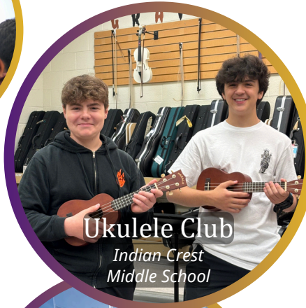
Ukulele Club Indian Crest Middle School