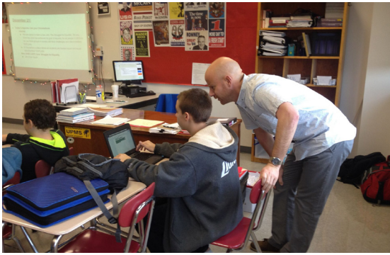
Thanks to the EITC funding from Univest Corporation, the IVEF was able to purchase Chromebooks for use in many district classrooms.

“Education is the number one area of giving within Univest’s Committed to Local philanthropic program. We partner with various organizations like the Indian Valley Education Foundation because we believe it is our responsibility to encourage educational excellence and to enhance and enrich educational opportunities for young people.”