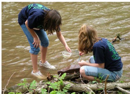
The Planet Keepers program enables students to engage in and understand the importance of caring for our earth