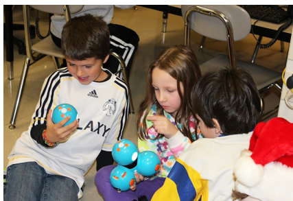
Dash & Dot ignite curiosity and confidence while providing fun ways of learning collaboration, communication, and digital literacy.