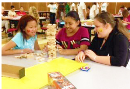
Students enjoying a WEB Event - a Middle School Orientation and Transition Program