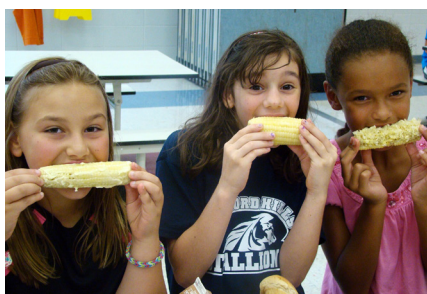
Students enjoying the fruits (& vegetables) of their labor thanks to the C.R.O.P.S. Program